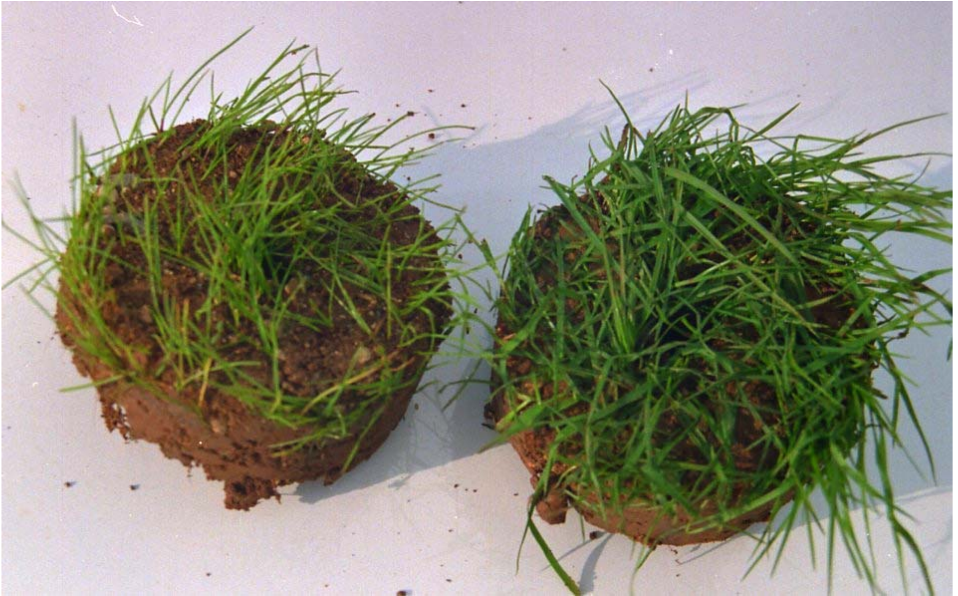
Soil cores taken after 30 days on the 75% clay loam soil. With foam on the right.