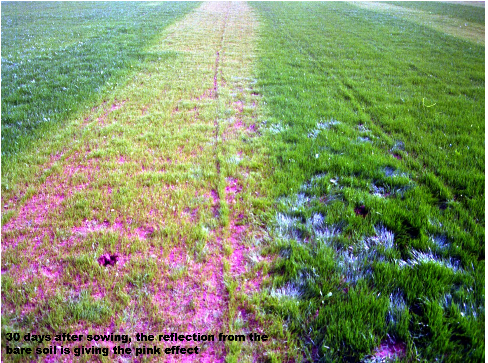
30 days after sowing, the reflection from the bare soil is giving the pink effect